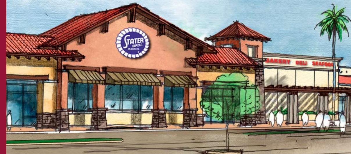
Heritage Square is located within the northwest quadrant of the intersection of McCall Blvd. and Menifee Road in the Menifee Valley, CA.