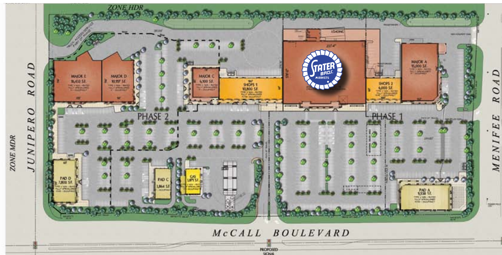
SITE PLAN SUBJECT TO CHANGE

Heritage Square is located just two miles east of Interstate 215 at Sun City. This newly developing area includes numerous planned subdivisions including the adjacent Heritage Lake (approximately 4,000 DUs) and McCall Mesa (264 DUs). The area is served by nearby Menifee Valley Medical Center, an 84-bed, full-service acute care hospital, several championship golf courses, a new county library and excellent K-12 schools.